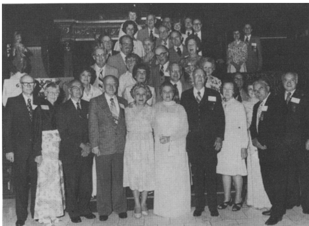
Past Presidents, their wives, and guests posed during annual Past President's dinner.